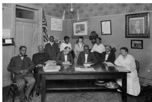
Meeting of the NAACP in Denver