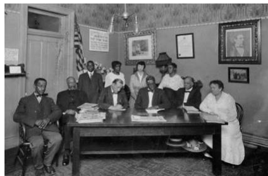
Meeting of the NAACP in Denver